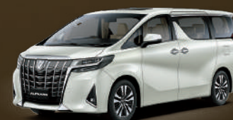
LUXURY WHITE PEARL

Toyota Motor Philippines reserves the right to change the vehicle specifications without prior notice. * Available for special order