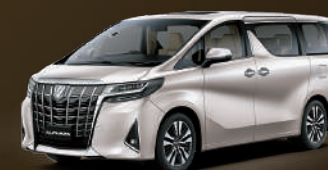
STEEL BLONDE METALLIC*