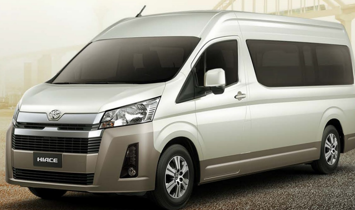
GL Grandia Tourer