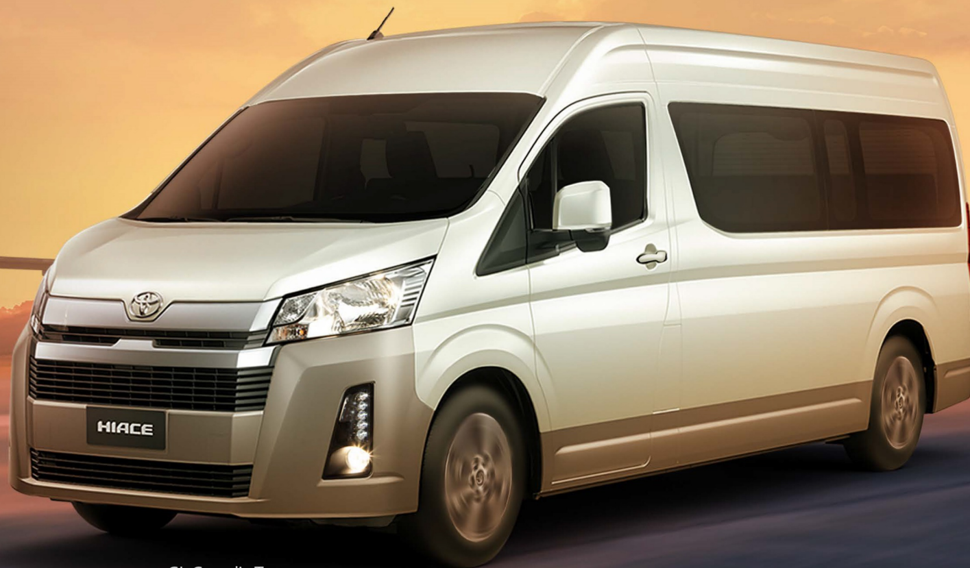
GL Grandia Tourer

More than just a striking silhouette, the Hiace's Semi-Bonnet shape enhances the safety of both driver and passengers while providing less noise, vibration and harshness, for a smoother, more comfortable travel experience.