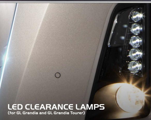
LED CLEARANCE LAMPS (for GL Grandia and GL Grandia Tourer)