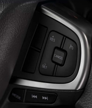
CRUISE CONTROL (for GL Grandia and GL Grandia Tourer)