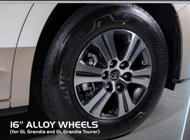
16" ALLOY WHEELS (for GL Grandia and GL Grandia Tourer)