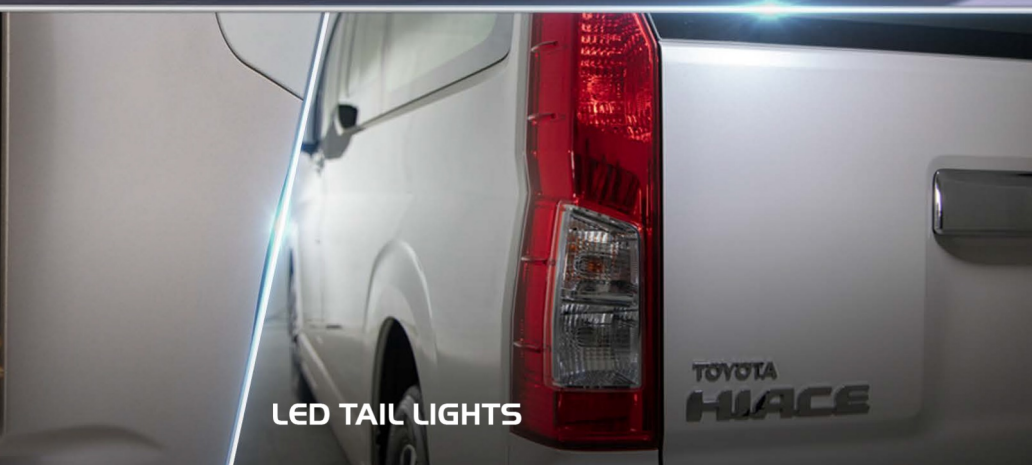
LED TAIL LIGHTS