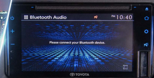
6.8" TOUCHSCREEN AUDIO (for GL Grandia and GL Grandia Tourer)

Boasting plush seats and a maximized cabin, the Hiace exudes top-class comfort.