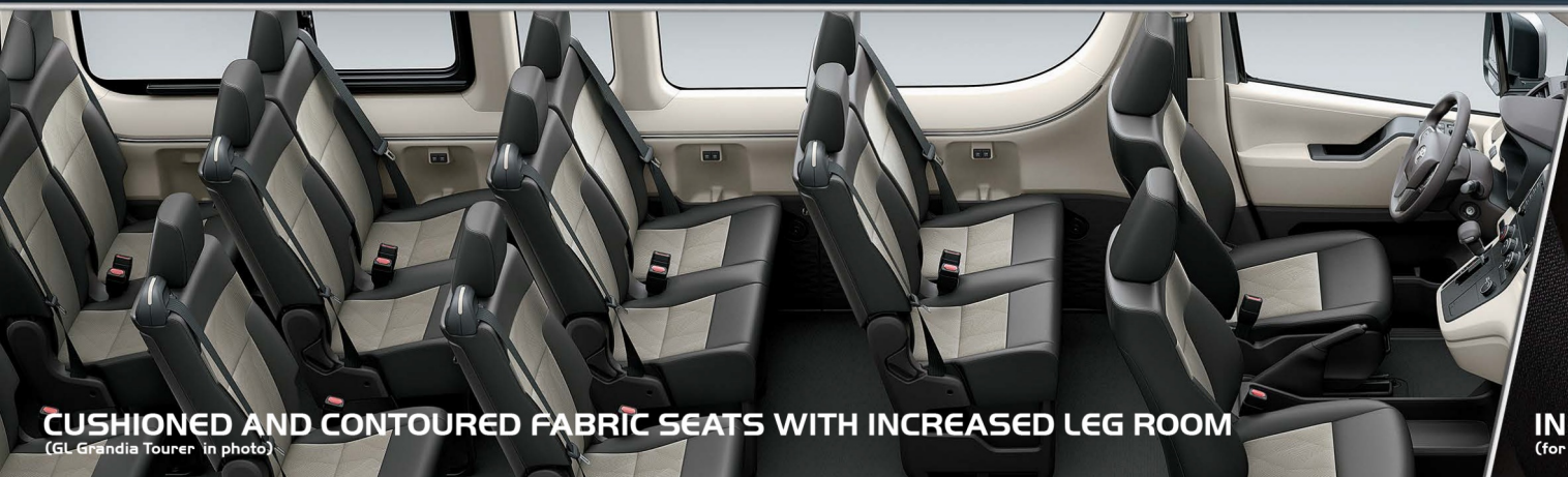
CUSHIONED AND CONTOURED FABRIC SEATS WITH INCREASED LEG ROOM (GL Grandia Tourer in photo)